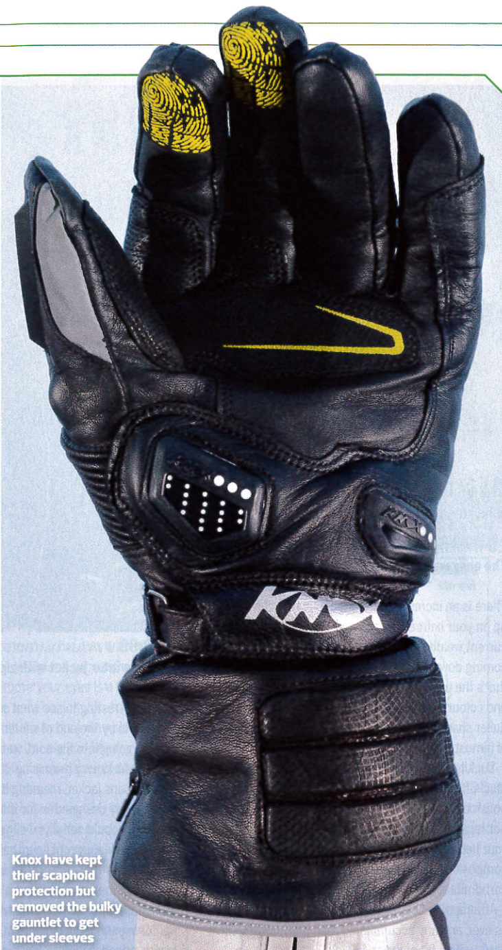
Knox have kept their scaphoid protection but removed the bulky gauntlet to get under sleeves