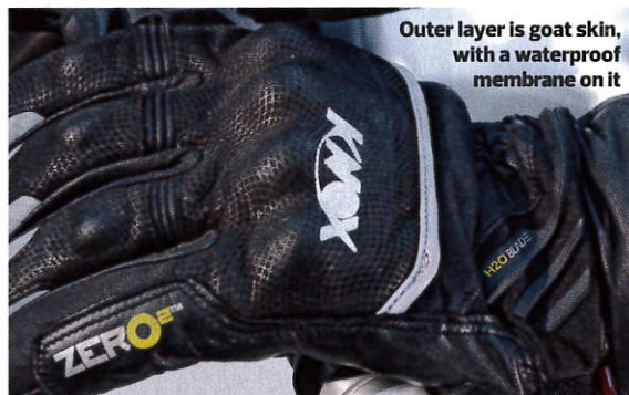
Outer layer is goat skin, with a waterproof membrane on it

Despite all the armour, it's undetectable when riding; the Zero 2 gives great feel despite the thickness. Other neat touches include liberal amounts of reflective material on the fingers and thumbs, grippy material on the palm and tips of the fingers, and a very effective visor wiping blade on the left thumb. Warm, dry, comfy and protective: a great winter glove. MH